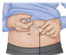
Pinch and inject