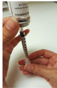
Figure 3. Gently turn the vial upside down taking care to not create air bubbles. Draw up your dose as directed by your protocol. For example, if your dose is 40 Units, draw up to the "40" mark on the syringe, if the dose is 80 Units, draw up to the "80" mark, etc. Once you obtain the appropriate volume in your syringe, tap gently and remove any air bubbles from the syringe before injecting.