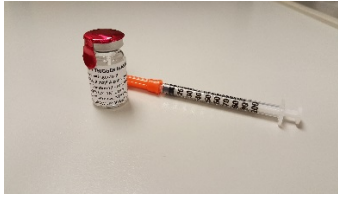
Figure 1. Your Leuprolide Trigger will contain a vial containing sufficient medication for your dose and a corresponding syringe.

If you have any questions about your injection, please call Mandell's at 877-252-0553.