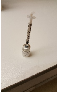
Figure 2. After washing hands thoroughly, wipe the top of the vial with alcohol. Remove the orange cap from the syringe and insert the needle into the vial as shown.